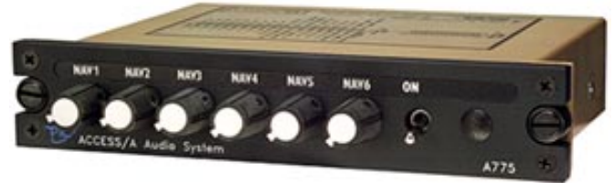
A775 Receiver Expansion unit

ICS LOOP CONTROL: Often, a ship has to be broken into isolated intercom circuits, such as Medevac applications, where the medical crew needs to work isolated from the flight crew. Using the ACCESS/A A770 eyebrow unit, additional receiver inputs, and full tie/split ICS loop control can be easily implemented. And in only 3 Dzus holes of panel space!