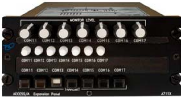
A711X Transceiver expansion unit

EXPANSION: ACCESS/A controls support 7 TX positions, which can be 6 radios and a PA, or 7 transceivers. Not enough? Need more inputs? Need more variable controls? The ACCESS/A architecture has special sum node connections that allow inputs and transceivers to be expanded indefinitely either using ACCESS/A system elements, or your custom external wiring.