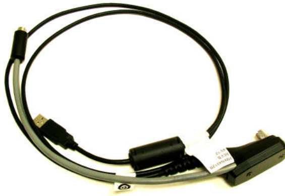
FIGURE 3: Programming Cable: “PC-9000” P/N 127499

P/N 127500 Encryption Keyload Cable (See Figure 4).