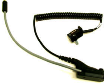
FIGURE 4: Encryption Keyloading Cable: “KVL-9000” P/N 127500