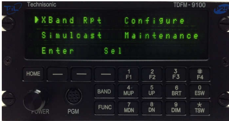
FIGURE 2: TDFM-9100 Function Menu

Pressing the FUNC key will bring up the following menu: